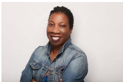
TARANA BURKE, CREATED THE "ME TOO" CAMPAIGN IN 2007

The widespread accounts of a culture of sexual abuse within the entertainment industry helped to spark a decade old movement, "Me Too," in which survivors of sexual abuse break their silence and sense of